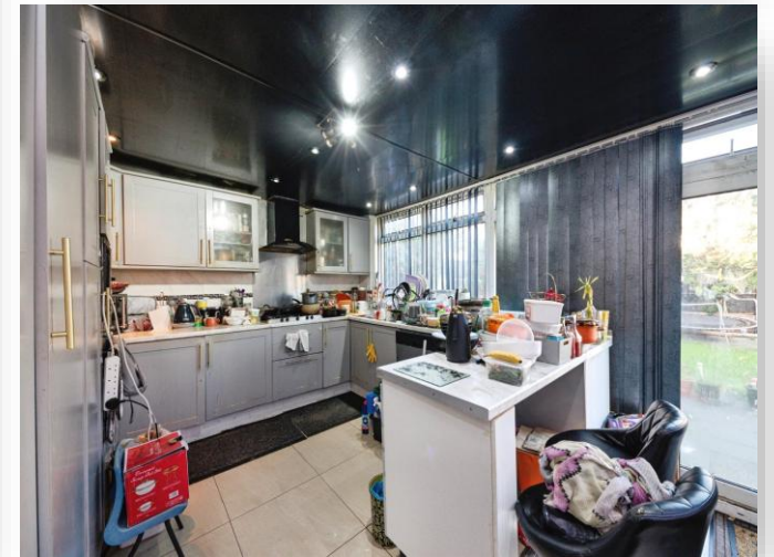
Brooklands Road, Birmingham B28 8JP