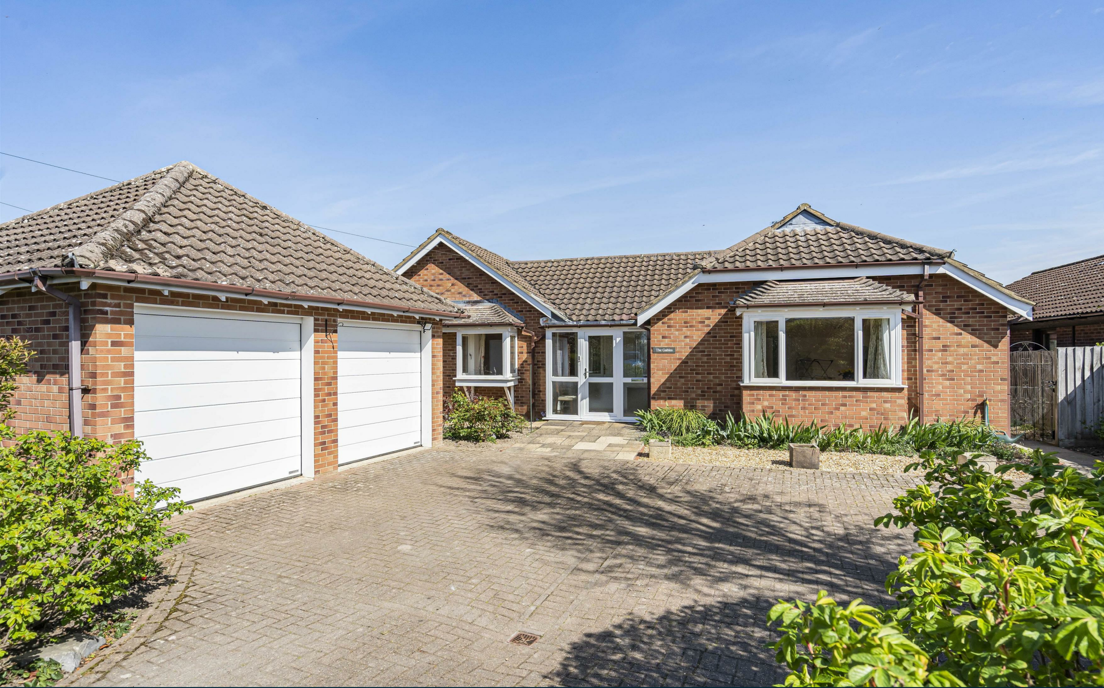
The Gables, Caxton Lane, Foxton, CB22 6SR