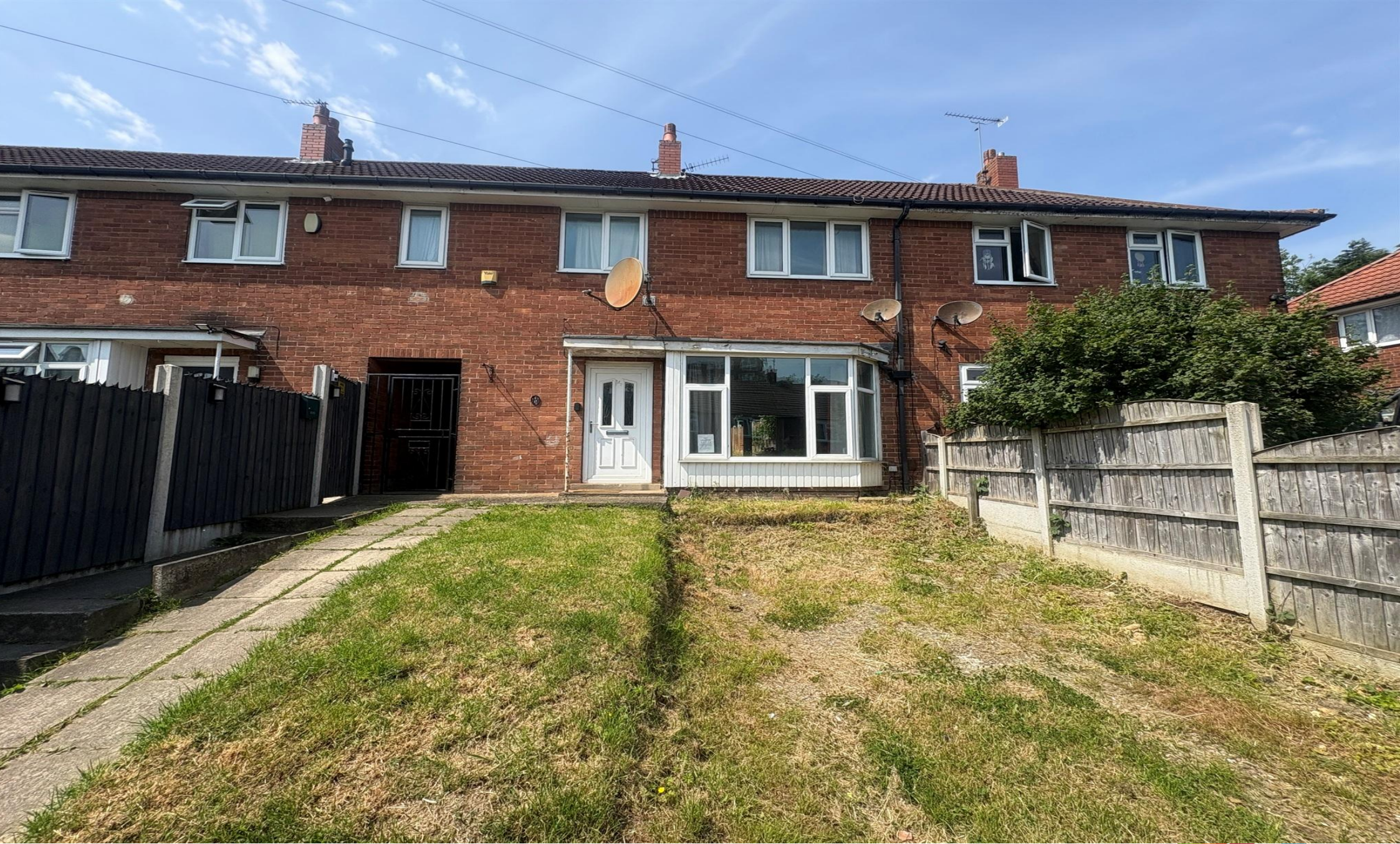
Whincover Gardens, Leeds LS12 5DB