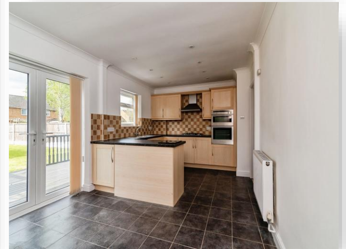
Sharphill Road, Edwalton Nottingham NG12 4BA