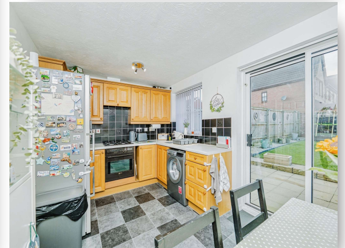
Locke Grove, St. Mellons Cardiff CF3 0PX