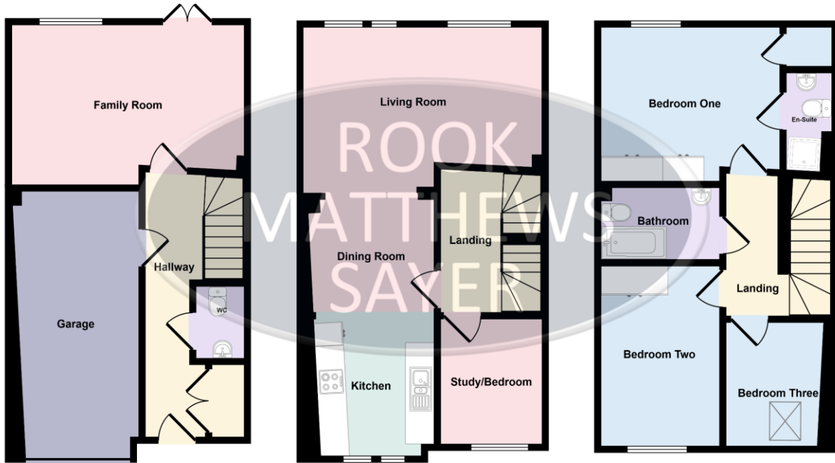
Ground Floor Approx 45 sq m / 480 sq ft

Approx Gross Internal Area 133 sq m / 1434 sq ft AL009349 Version 2