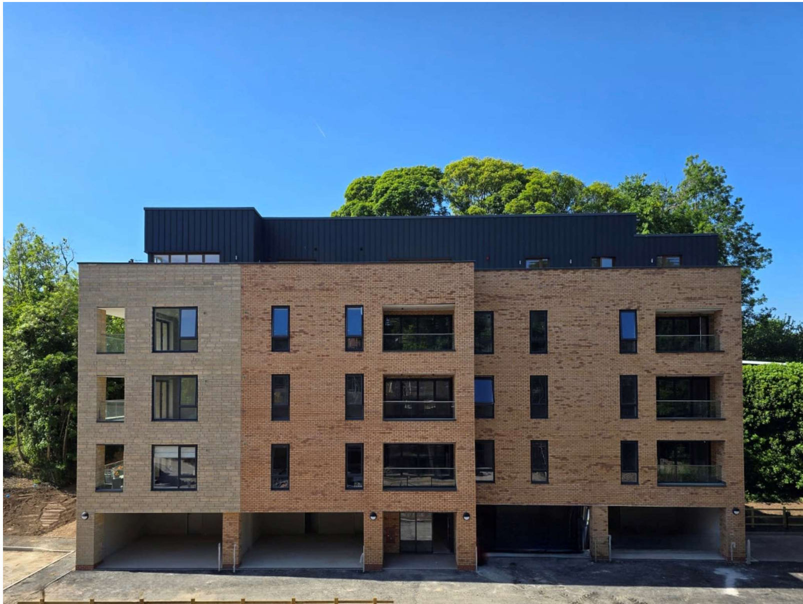
Mustard Mills Luxury Apartments Valley Lane, Mansfield NG18 2HT