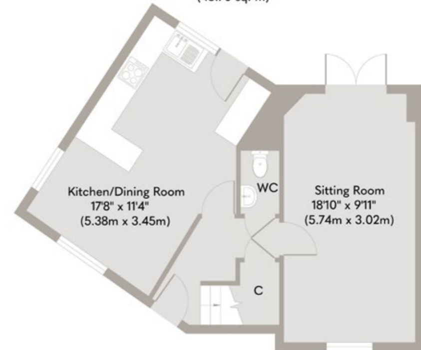
Ground Floor Approximate Floor Area 491 sq. ft (45.61 sq. m)

Whilst every attempt has been made to ensure the accuracy of the floor plan contained here, measurements of doors, windows, rooms and any other items are approximate and no responsibility is taken for any error, omission, or mis-statement. This plan is for illustrative purposes only and should be used as such by any prospective purchaser or tenant. The services, systems and appliances shown have not been tested and no guarantee as to their operability or efficiency can be given.