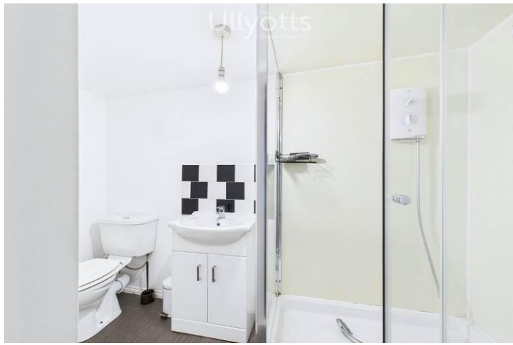
Ground Floor Shower Room