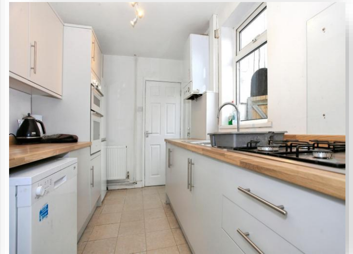
Duke Street, Peterborough PE2 8EB