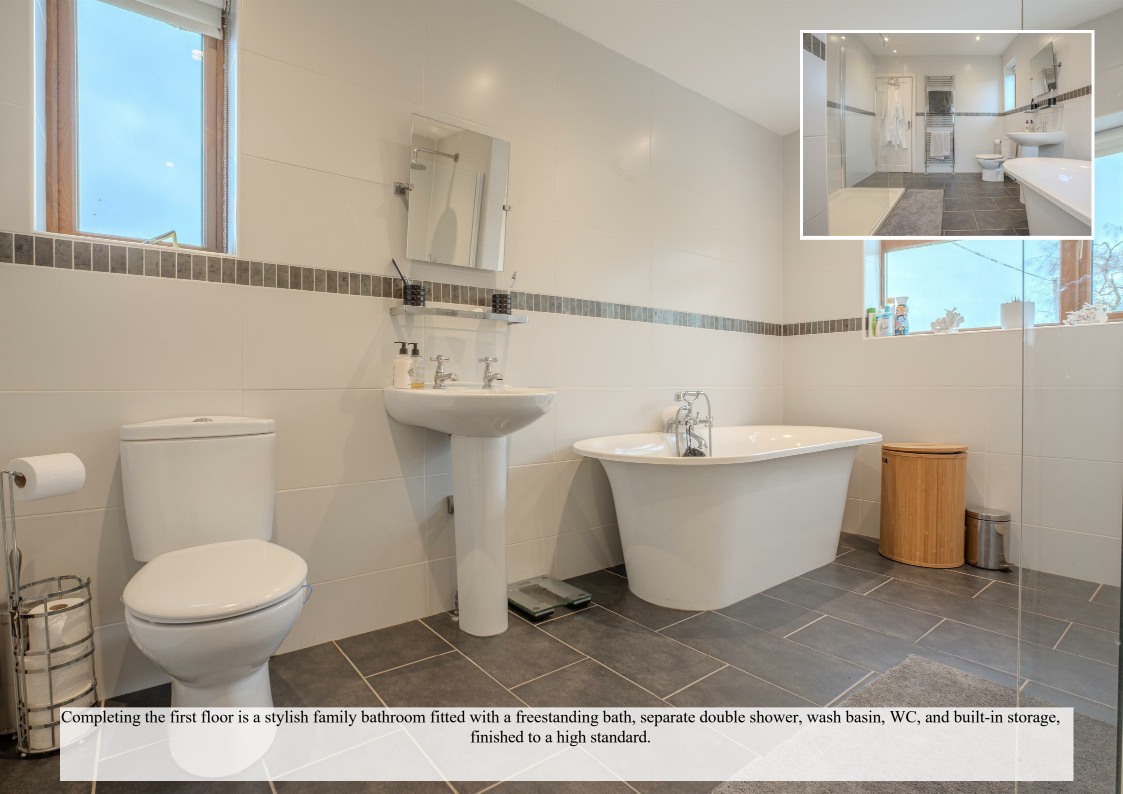
Completing the first floor is a stylish family bathroom fitted with a freestanding bath, separate double shower, wash basin, WC, and built-in storage, finished to a high standard.