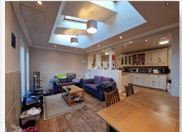
Shepherd Close, Norwich NR5 8HS