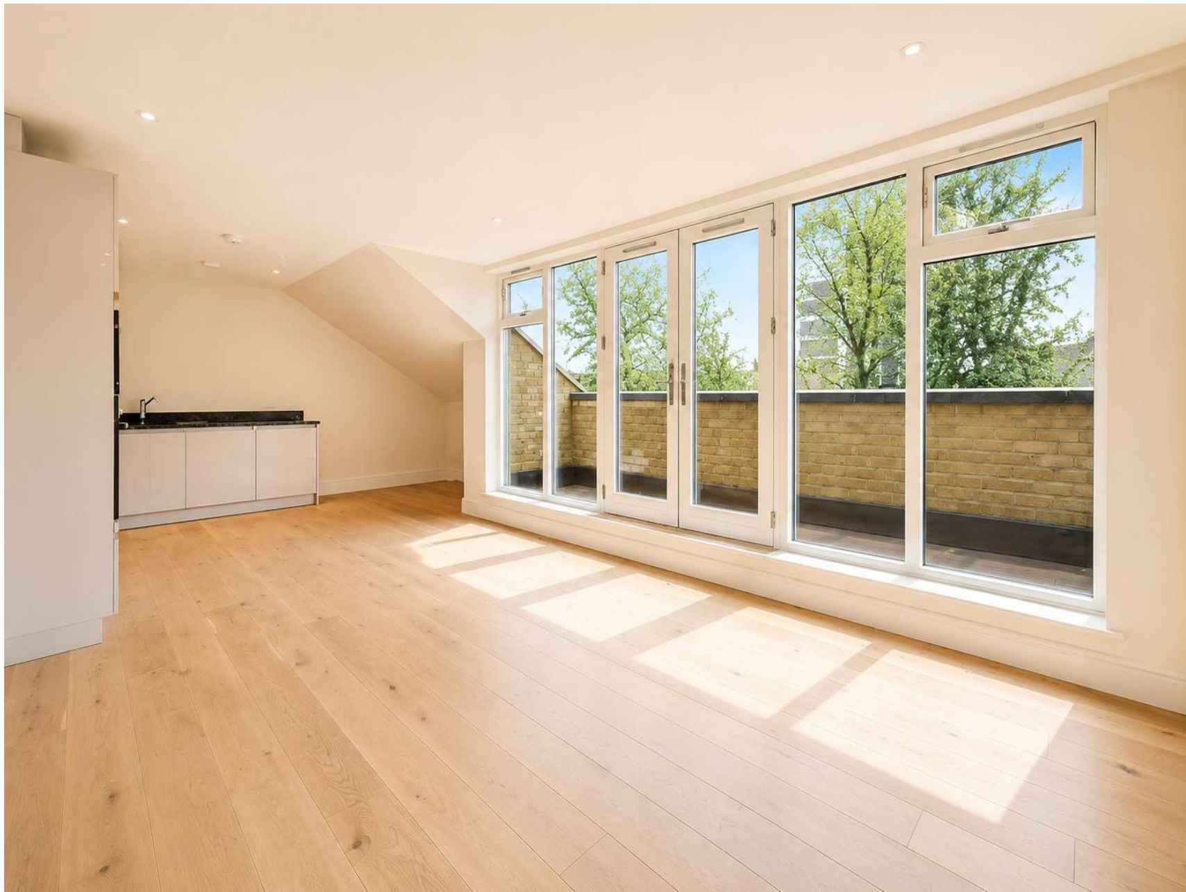
Courland Grove, London SW8 2PX