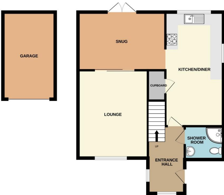
GROUND FLOOR 806 sq.ft. (74.9 sq.m.) approx.