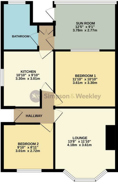
GROUND FLOOR 669 sq.ft. (62.2 sq.m.) approx.

TOTAL FLOOR AREA: 669 sq ft. (62.2 sq.m.) approx. Whilst every attempt has been made to ensure the accuracy of the floorplan contained here, measurements of doors, windows, stairs and any other items are approximate and no responsibility is taken for any error, omission or mis-statement. This plan is for illustrative purposes only and should be used as such by any prospective purchaser. The services, systems and appliances shown have not been tested and no guarantee as to their operability or efficiency can be given. Made with Housieplan (2020)