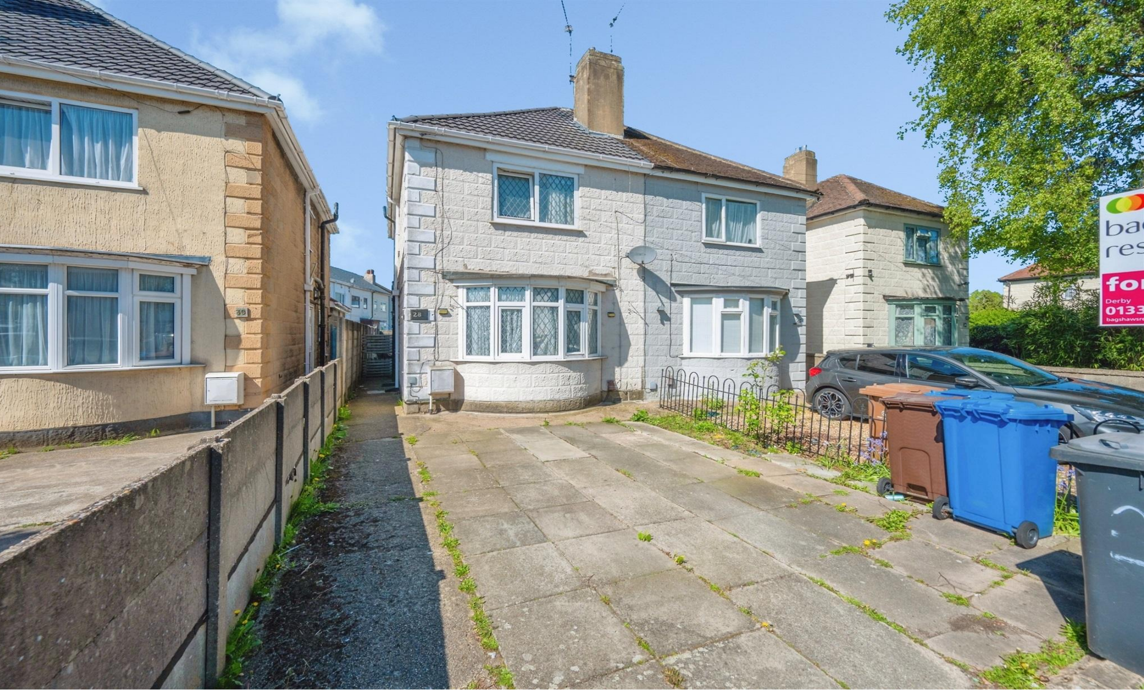
Stanley Road, Alvaston Derby DE24 0AA