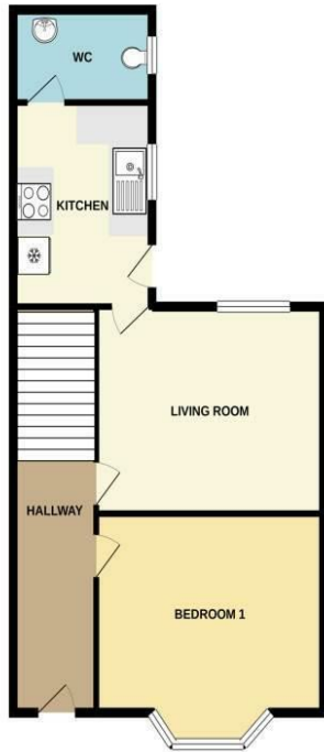
GROUND FLOOR 682 sq. ft. (63.3 sq. m.) approx.