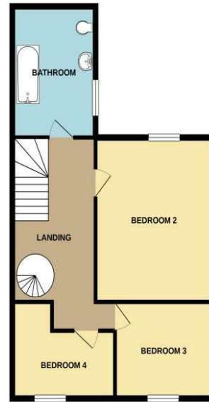
1ST FLOOR 610 sq. ft. (56.7 sq. m.) approx.