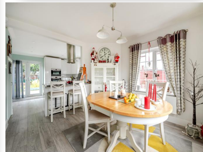
The Cottage, 2 Court Close, Maidenhead SL6 2DL