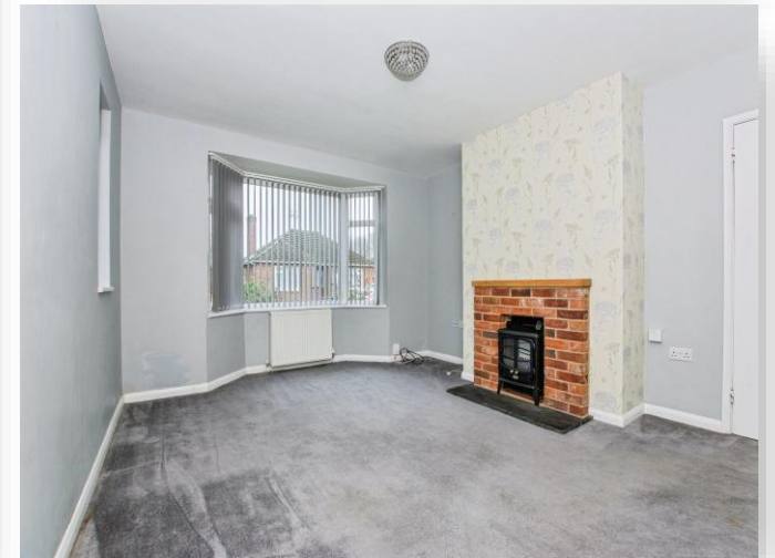
The Chase, Leverington Road, Wisbech, PE13 1RX