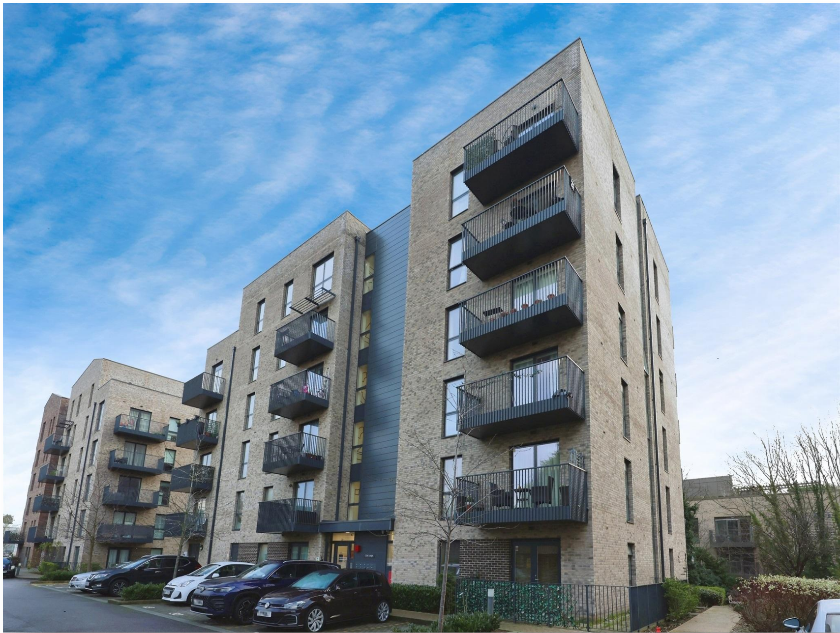
Oak Lodge, Riverwell Close, Watford, WD18 0GZ