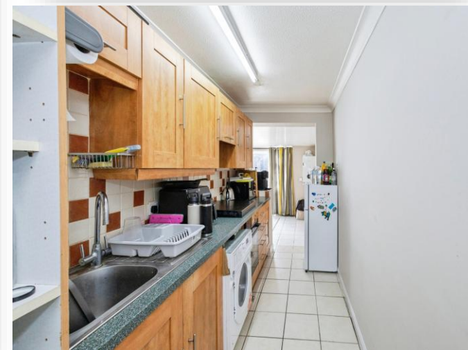
Deane Gardens, Lee-On-The-Solent, PO13 8JZ