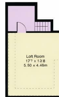
Garage First Floor