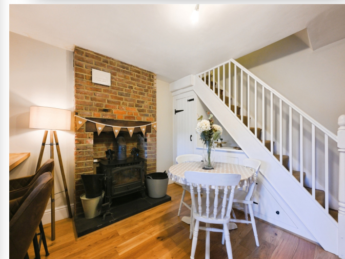
Gore Lane Cottages, Ware SG11 1BX