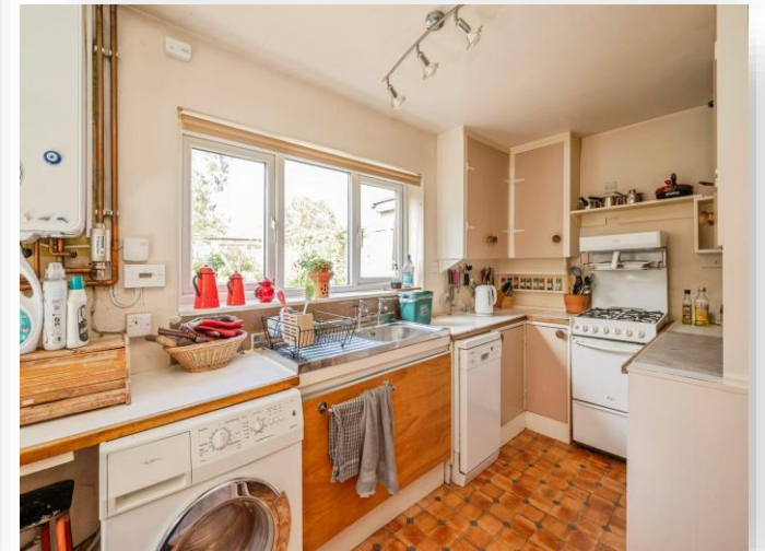
Hungate Street, Aylsham, Norwich, NR11 6EA