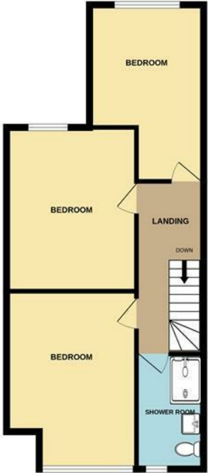
1ST FLOOR 561 sq.ft. (52.2 sq.m.) approx.