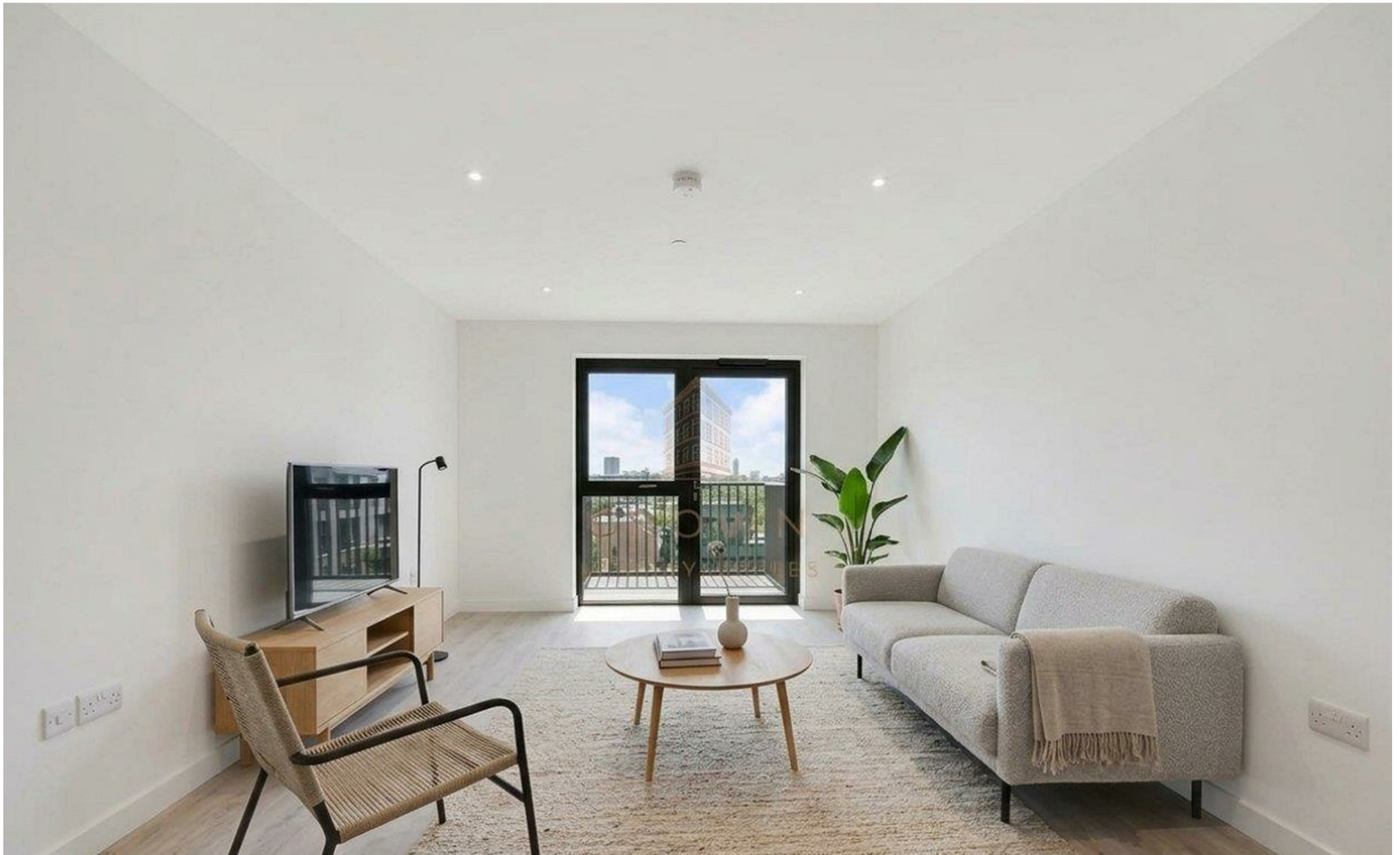
Flat 34 Scarlet Court Damsel Grove, London, N4 2UG £2,500