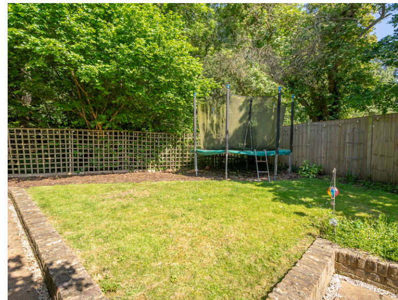
Little Charnwood, Cherry Drive, Forty Green, Beaconsfield, Bucks, HP9 1XP