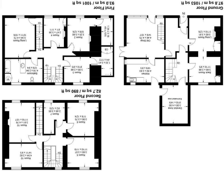
Illustration for identification purposes only; measurements are approximate, not to scale.