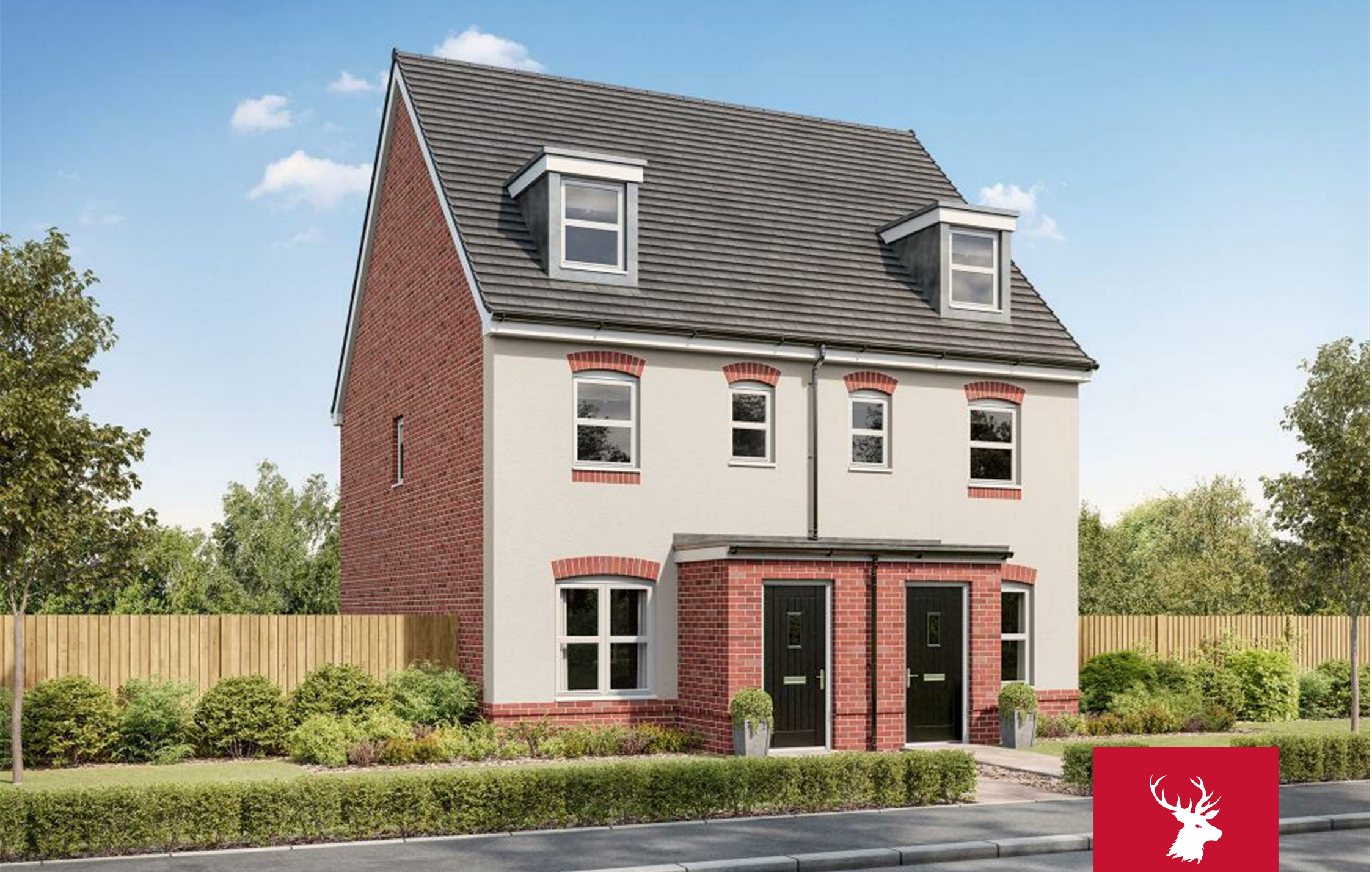
The Saunton, Plot 99