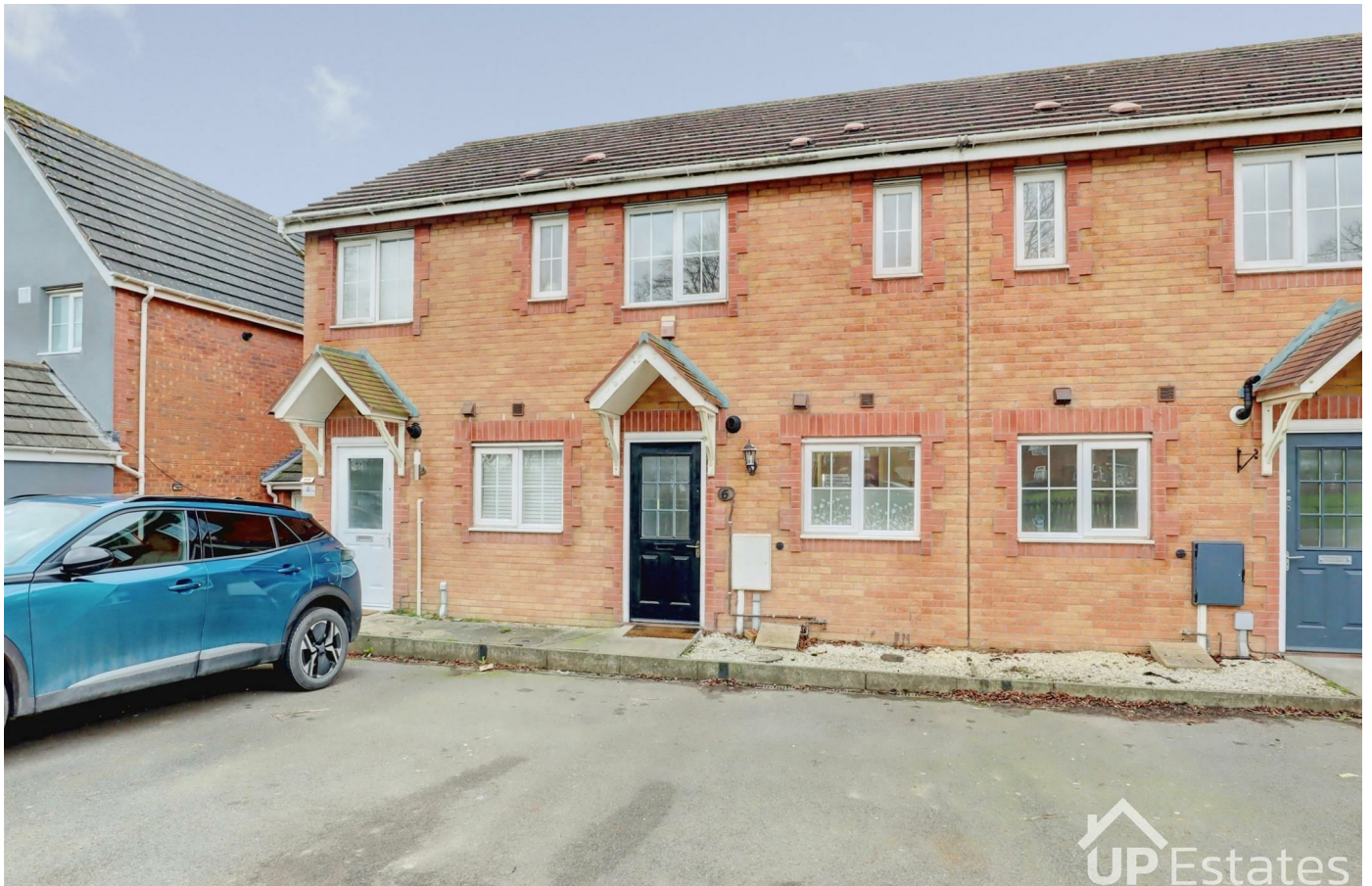
Ryders Hill Crescent, Nuneaton