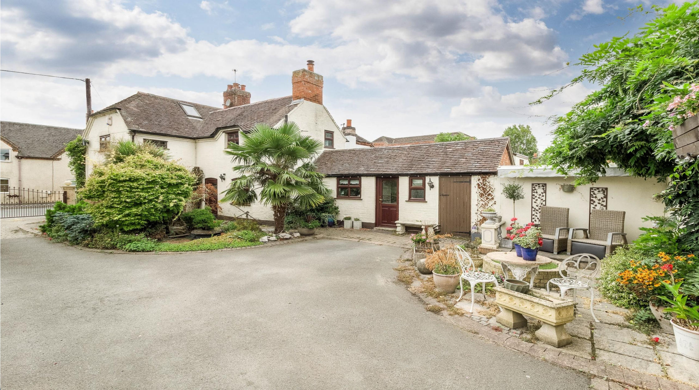
Holly Cottage, 16 Main Road, Twycross, Warwickshire, CV9 3PL