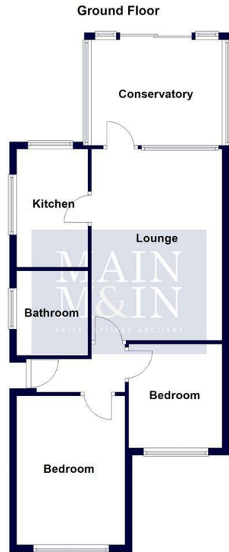
For Illustration Purposes Only. Not To Scale Plan produced using PlanUp. 149 Queensway, Heald Green