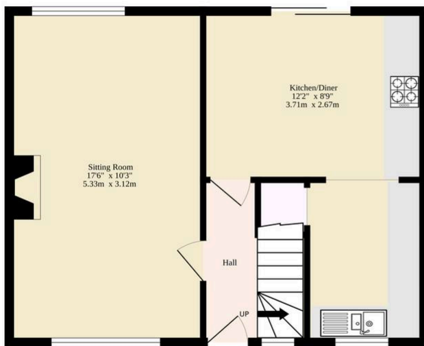
Ground Floor 387 sq.ft. (36.0 sq.m.) approx.