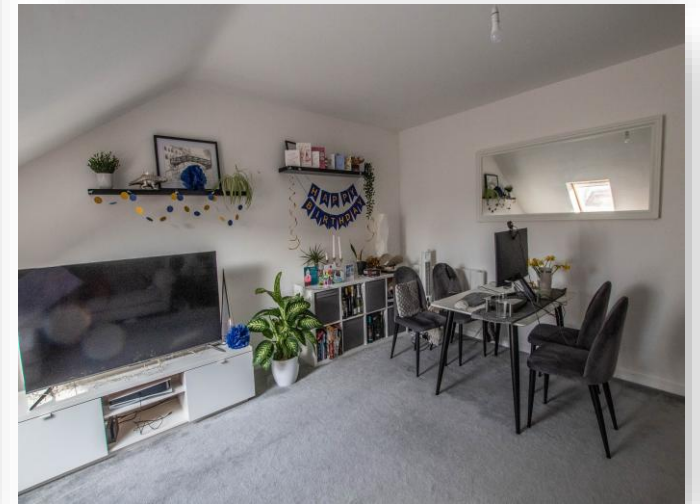
Cootes Court Cootes Lane, Fen Drayton, CB24 4YP