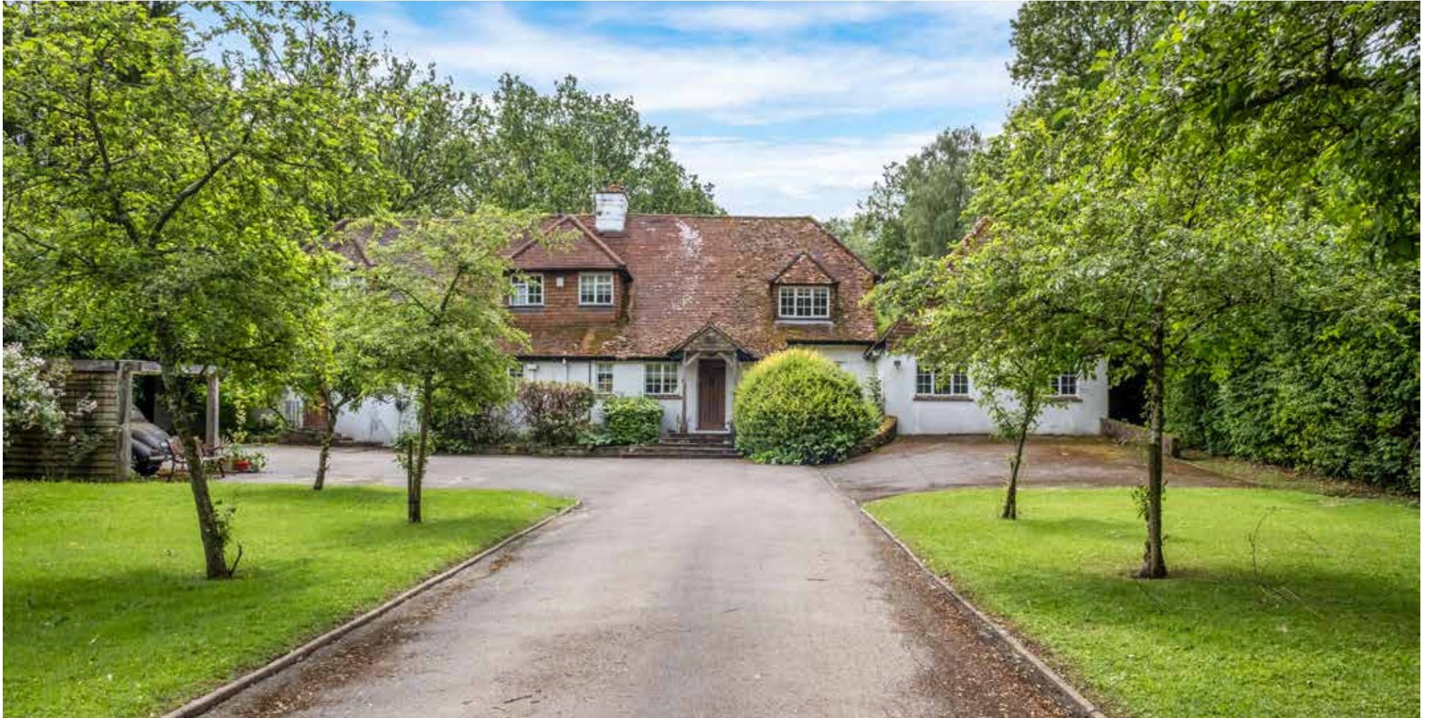
LONG ACRE, HOLDFAST LANE, HASLEMERE