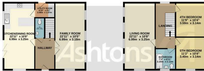
1ST FLOOR 640 sq.ft. (59.5 sq.m.) approx.