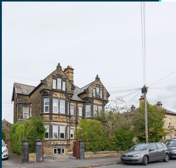
West Cliffe Grove, Harrogate, HG2