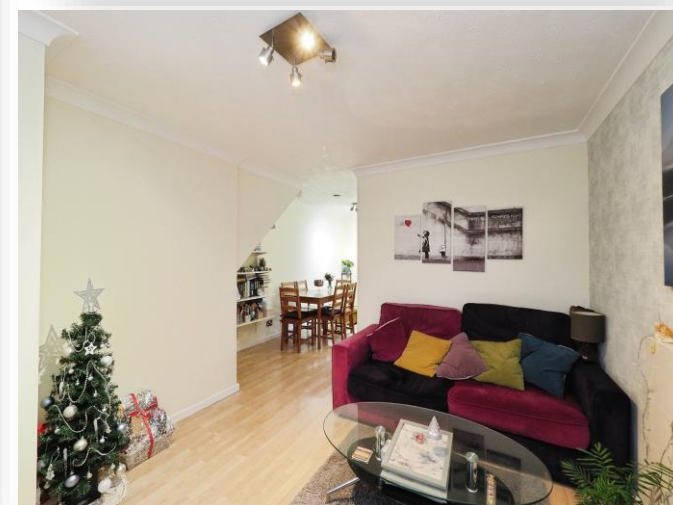
Ravensthorpe Drive, Loughborough