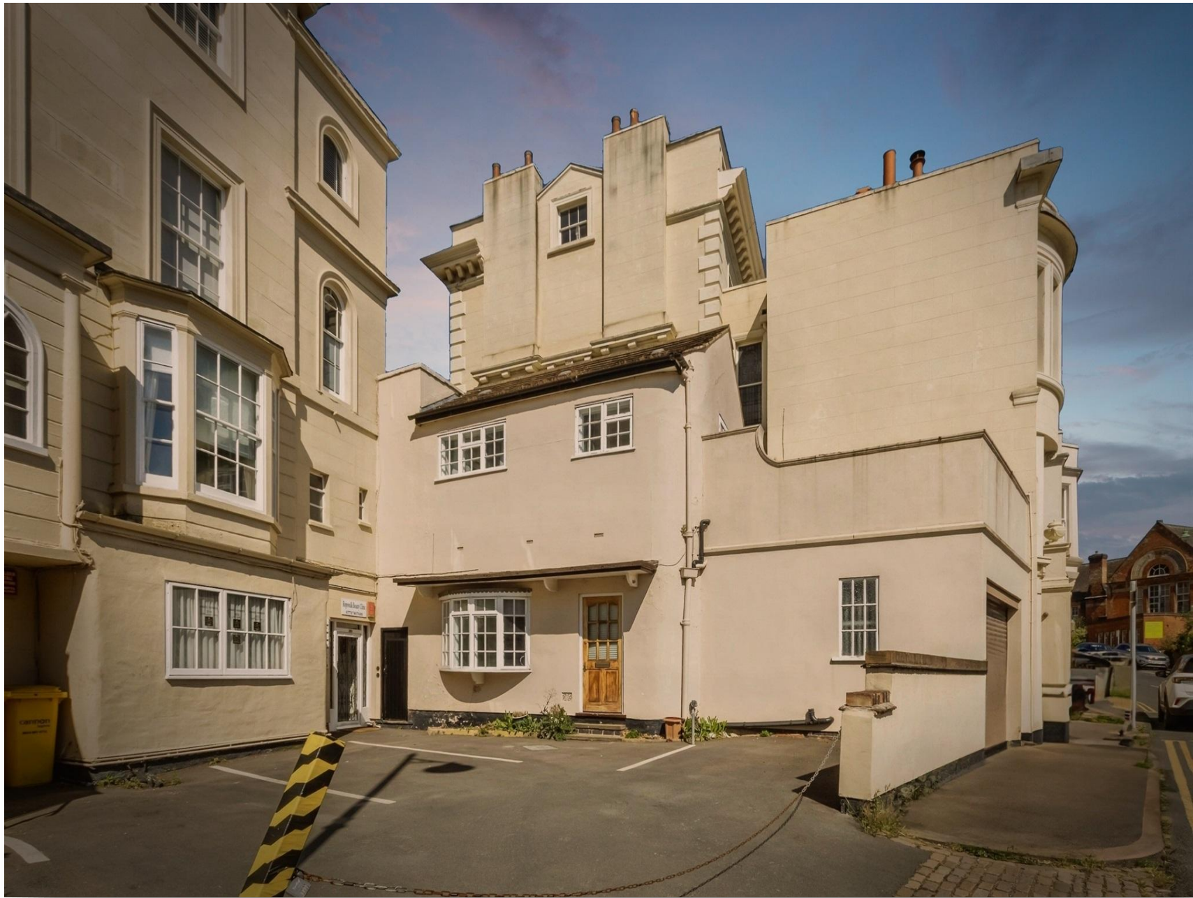
The Ropewalk, Nottingham NG1 5DW