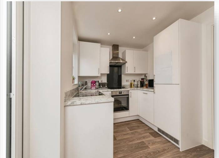
Jacquard Road, Skelmanthorpe HUDDERSFIELD HD8 9ZB