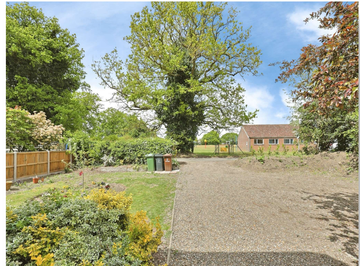
Swathing, Cranworth, IP25 7SJ