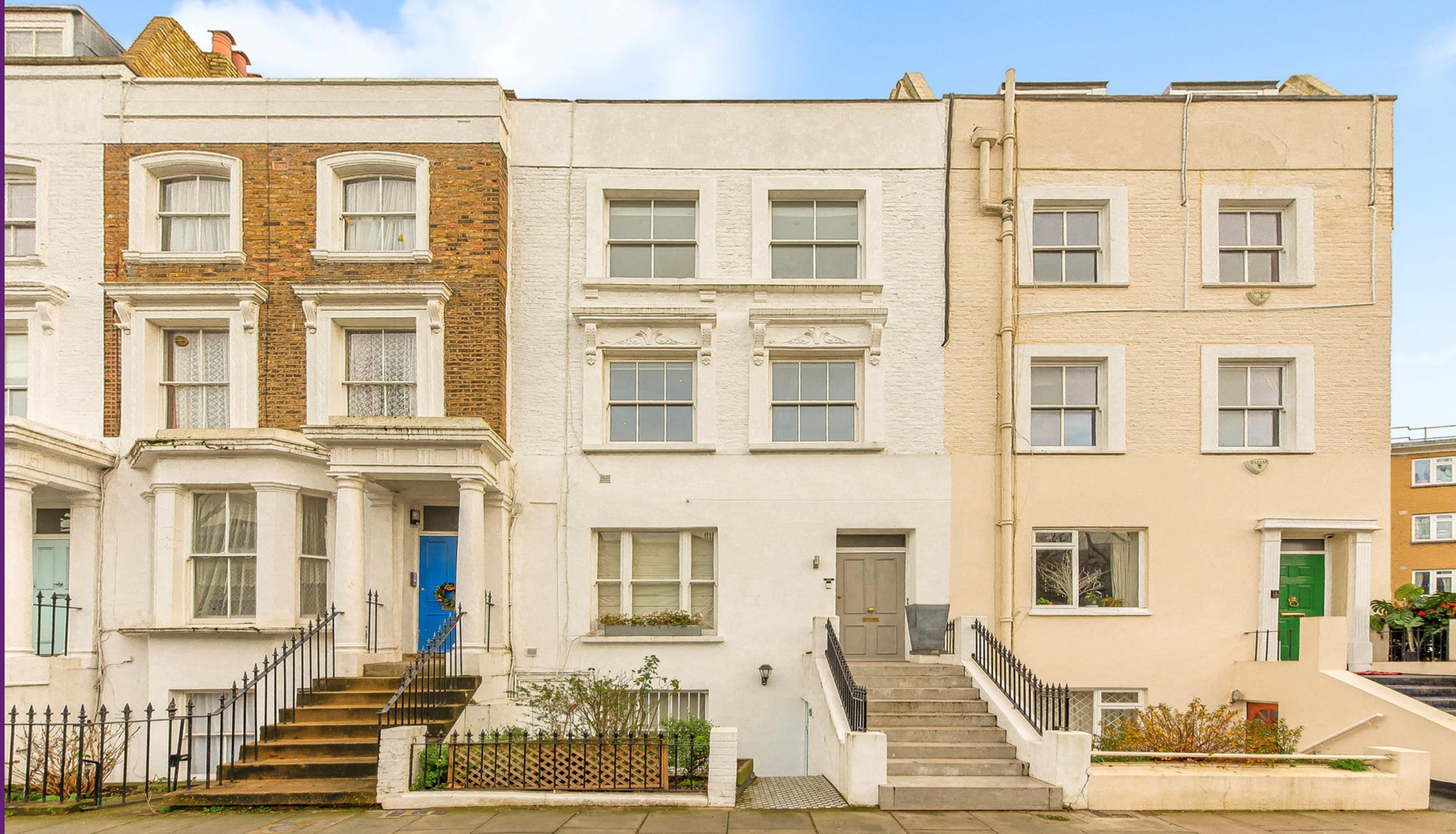
Cornwall Crescent London, W11