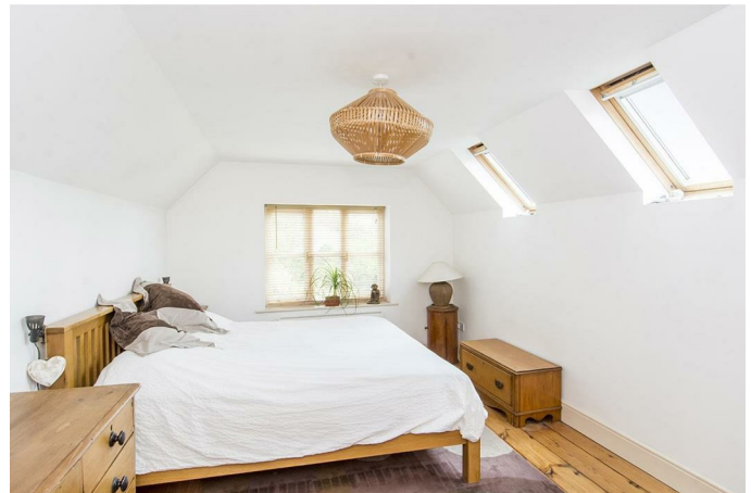
Bedroom One 16'1" x 10'8" (4.90m x 3.25m)

Light and airy pitched ceiling room with two double glazed velux windows, and further double glazed window to the rear aspect. Door to a shower cubicle with mains shower fitment and double glazed velux window. Further door to:-