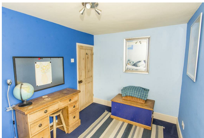
(Bedroom Four Photo Two)