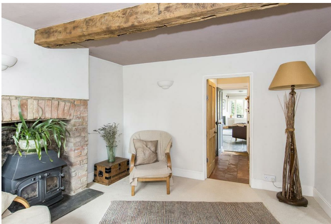
Front Lounge 11'6" x 10'9" (3.51m x 3.28m)

Multi paned double glazed window to the front elevation. Feature cast iron woodburning stove with exposed brick surround. Radiator. Two wall lights. Door to inner lobby.