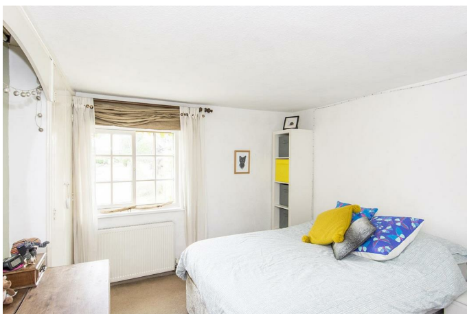
(Bedroom Three Photo Two)

Double glazed window to the front elevation. Period open fireplace. Radiator.