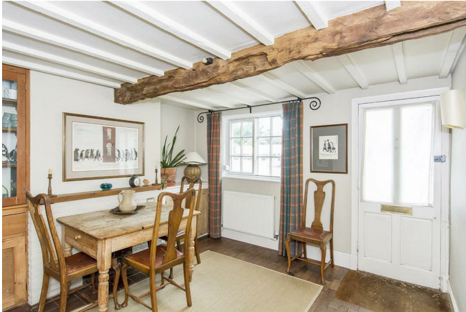
Dining Room 11'6" x 11'6" (3.51m x 3.51m)

Accessed via glazed timber front door. Multi paned double glazed window to the front. Brick constructed open fireplace. Fitted glazed display cabinets and base unit. Exposed ceiling beams. Woodblock flooring. Two wall lights. Radiator. Doors to the front lounge and kitchen area.