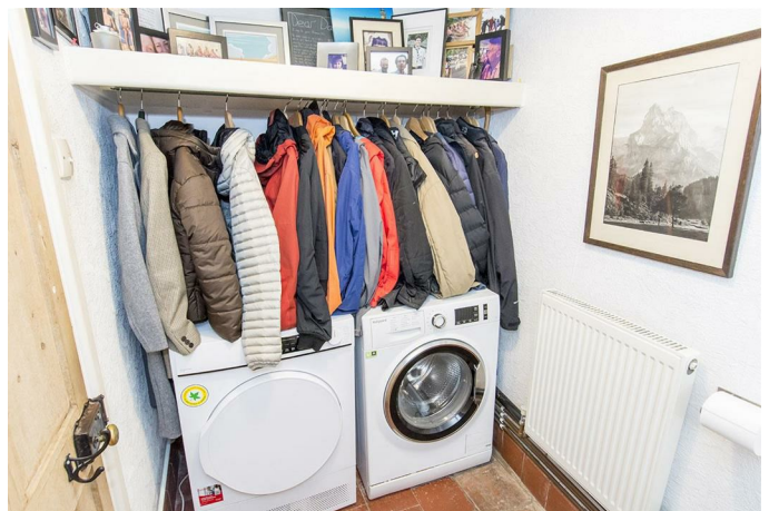
Utility/WC 7'6" x 4'9" (2.29m x 1.45m)

Wash hand basin and low level WC. Space and plumbing for automatic washing machine. Radiator. Quarry tiled flooring.