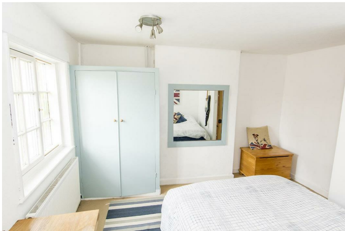
(Bedroom Two Photo Two)