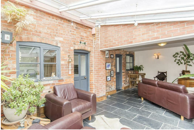
Garden Room (Photo Two)