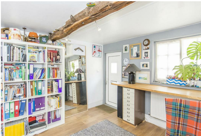
Study 11'5" x 10'9" (3.48m x 3.28m)

Double glazed front door. Multi paned window to the front. Feature open fireplace.