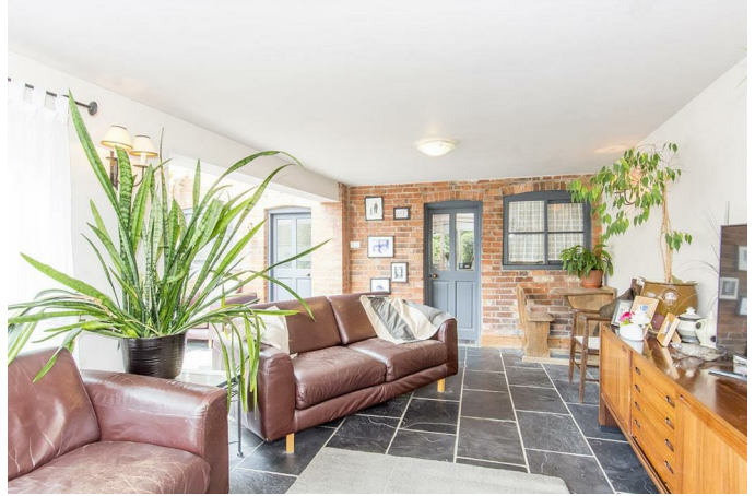
Rear Lounge (Photo Two)