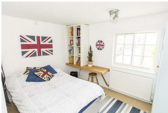
Bedroom Two 11'5" x 11'3" max (3.48m x 3.43m max)

Multi paned window to the front aspect. Radiator. Fitted wardrobe.