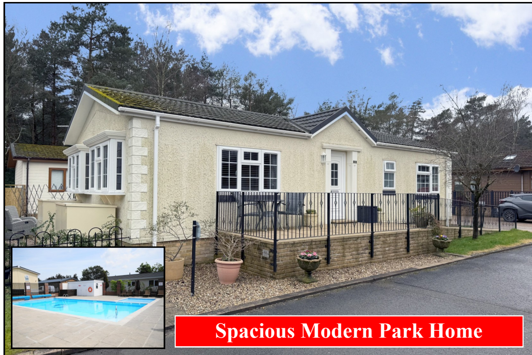
Spacious Modern Park Home

46 Tall Trees Park, Matchams Lane, Christchurch, Dorset. BH23 6TT