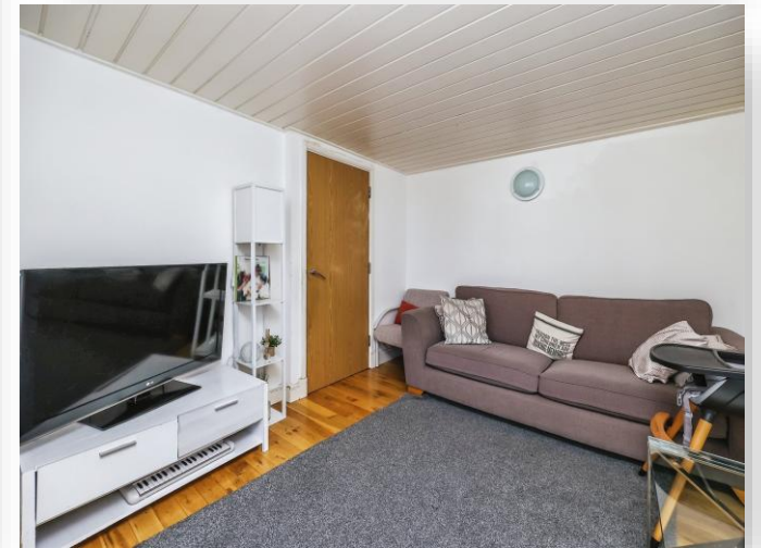
The Exchange Lee Street, Leicester LE1 3AH