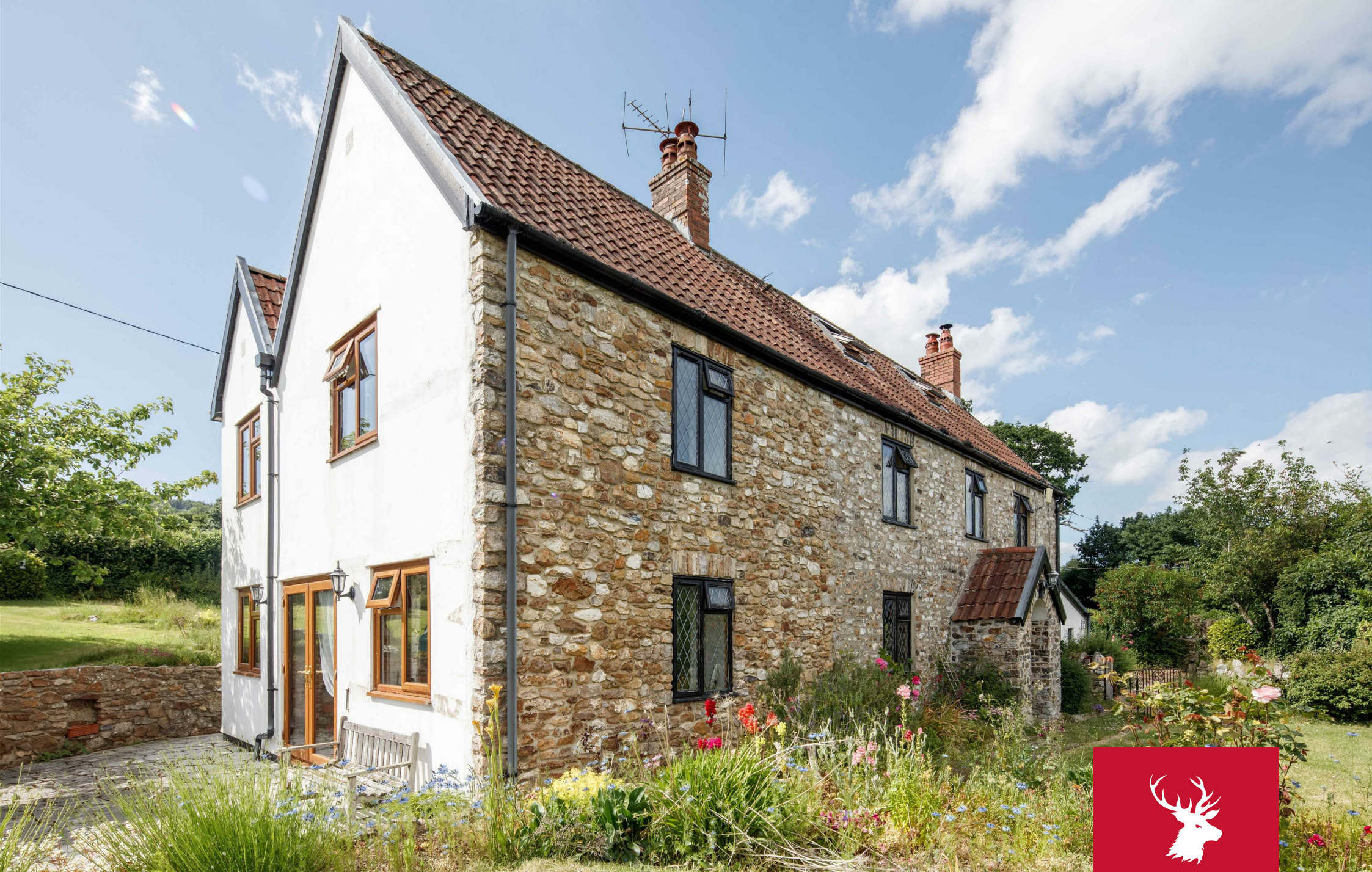
Stock House Cottage