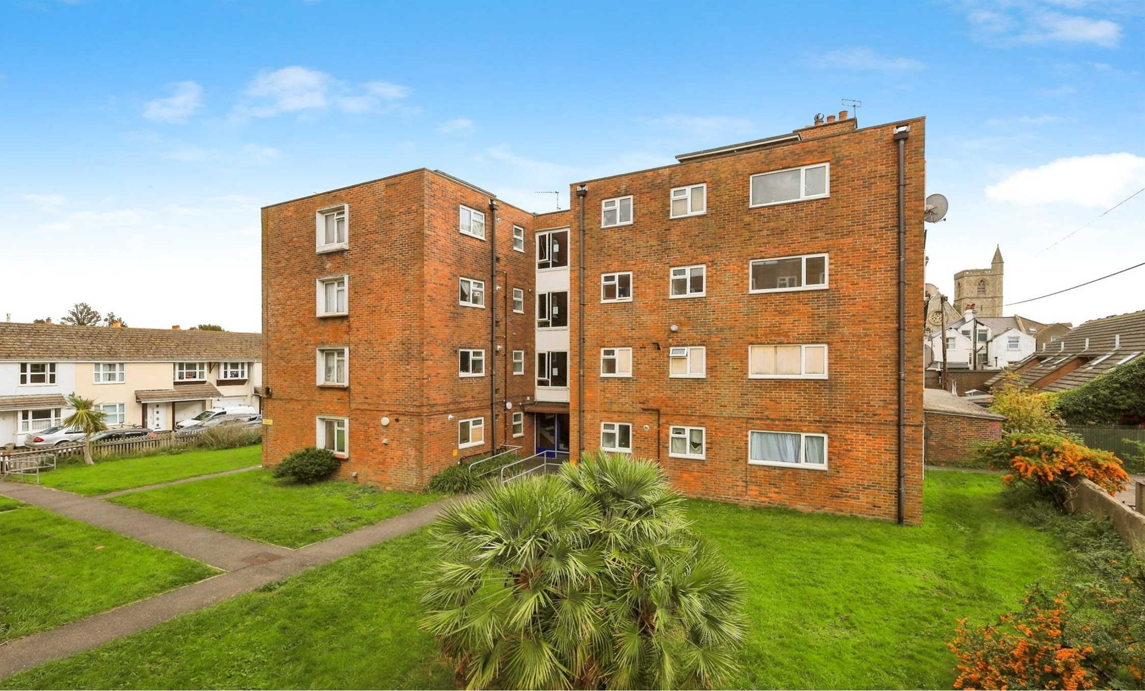
Cheshire Court Leslie Street, Eastbourne BN22 8JF