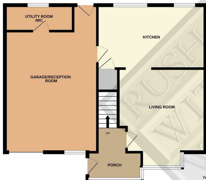
GROUND FLOOR 755 sq.ft. (70.2 sq.m.) approx.