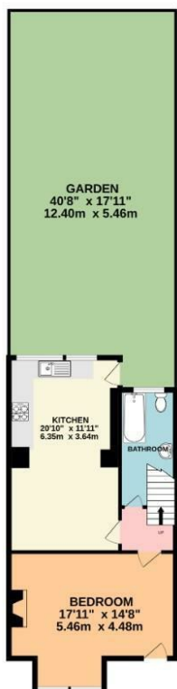
BASEMENT 561 sq ft. (52.1 sq.m.) approx.