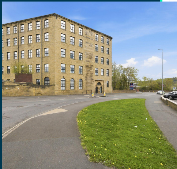
Pellon Lane, Halifax, HX1